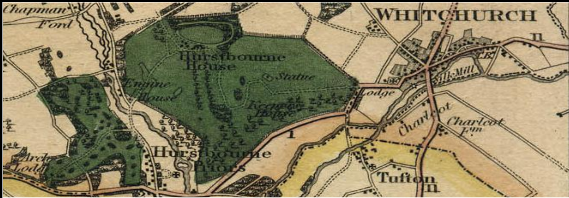
Hurstbourne House, Whitchurch – Seat of the Earl of Portsmouth .