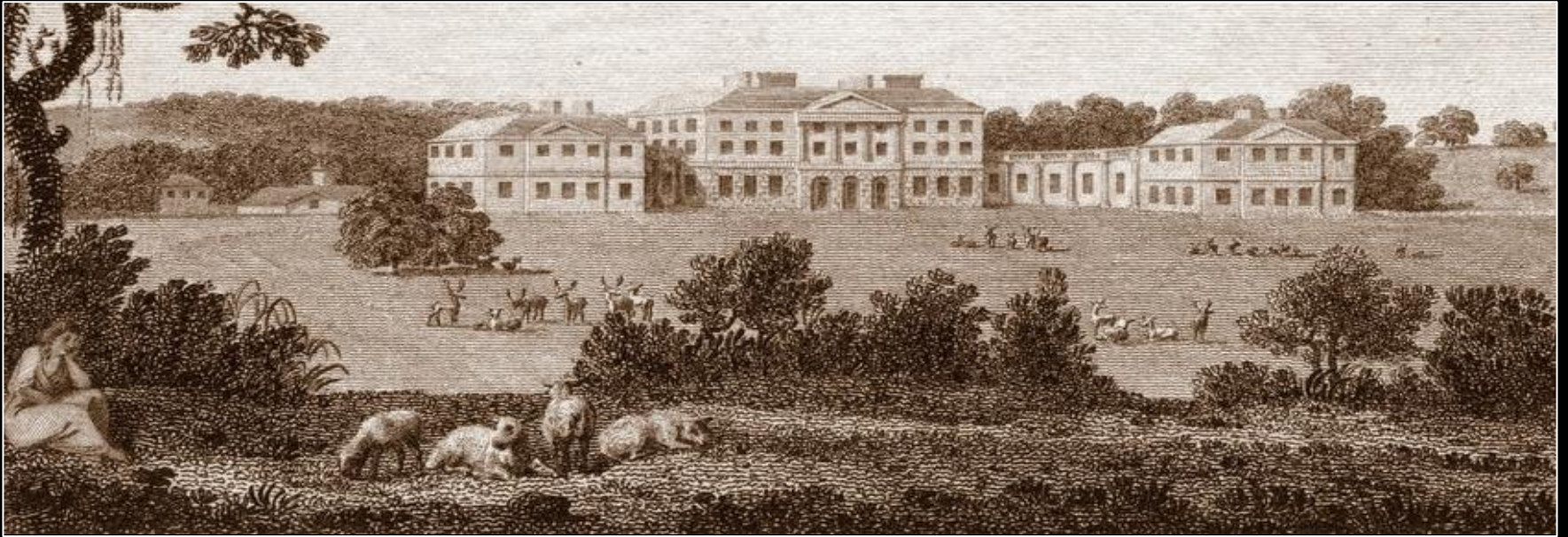
Hurstbourne House, Whitchurch – Seat of the Earl of Portsmouth .