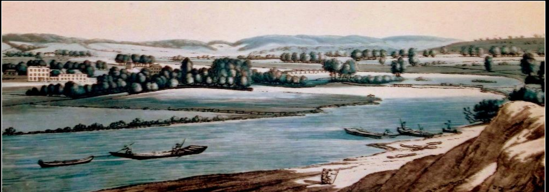
Hurstbourne Park can be seen on the left of this engraving of Whitchurch dated 1793