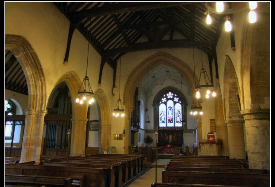
All Hallows Church interior.