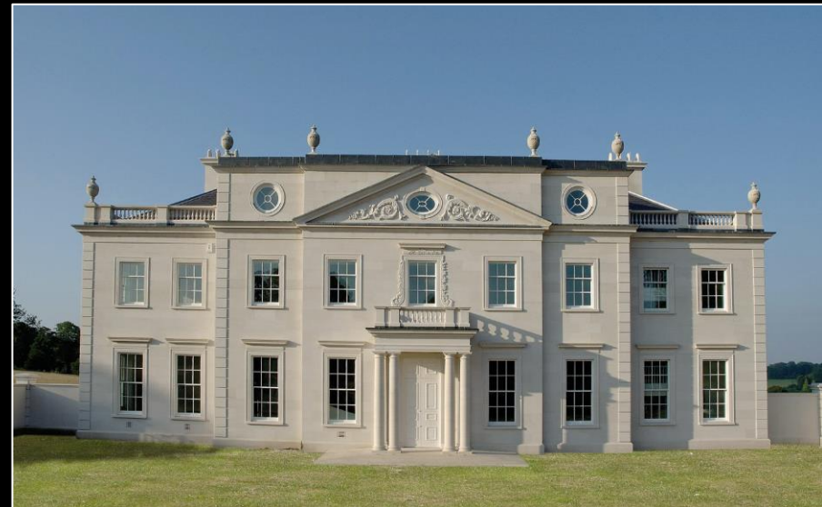
Hurstbourne Park House today.