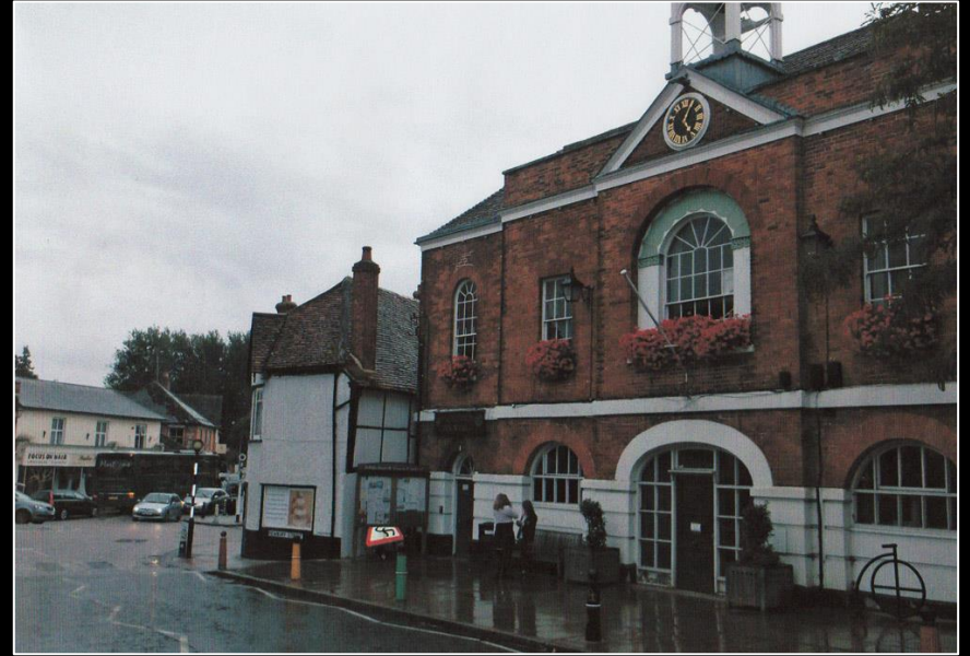
Town Hall, Whitchurch.