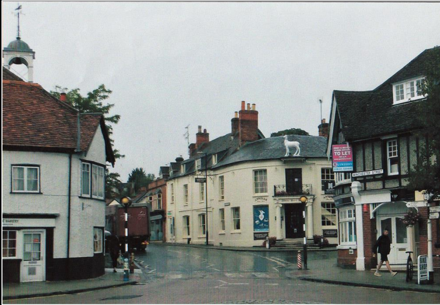
White Hart Inn, Whitchurch.