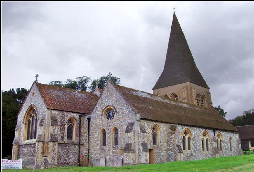
All Hallows Church, Whitchurch.