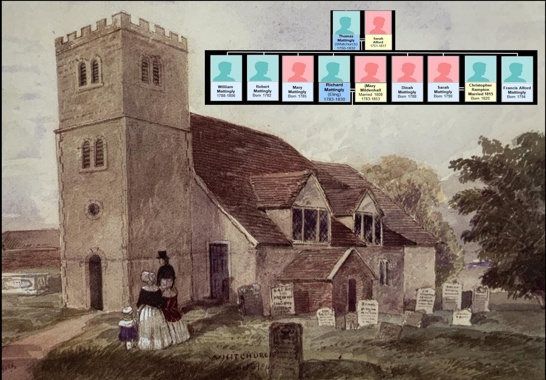
All Hallows Church. Whitchurch.