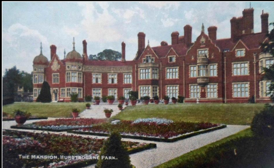
Hurstbourne Park House in 1911.