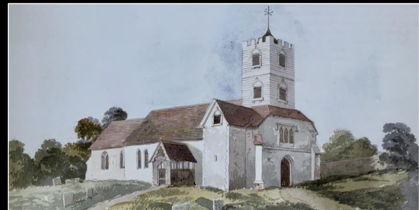
All Saints Church. Monk Sherborne near Wootton St. Lawrence